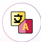
Localization and Translation