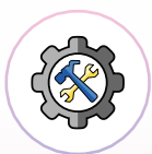
Apps and Learning Platforms